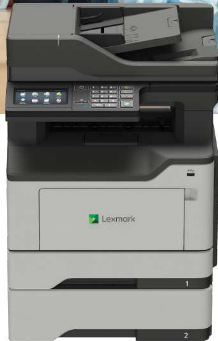
MB2442adwe with optional tray